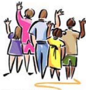
Say Goodbye to Our Pastor and Family